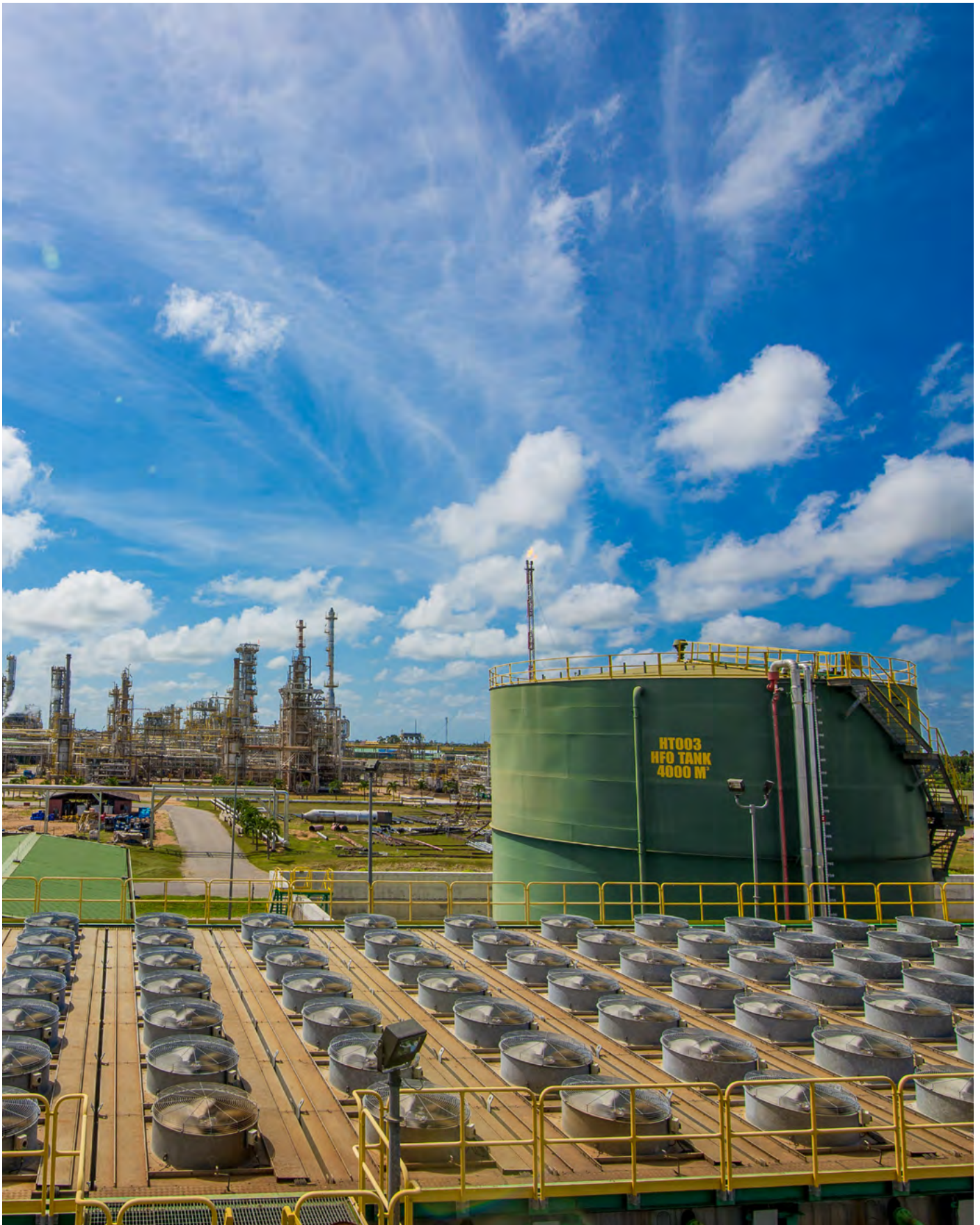
■ View on the refinery from the SPCS power plant.