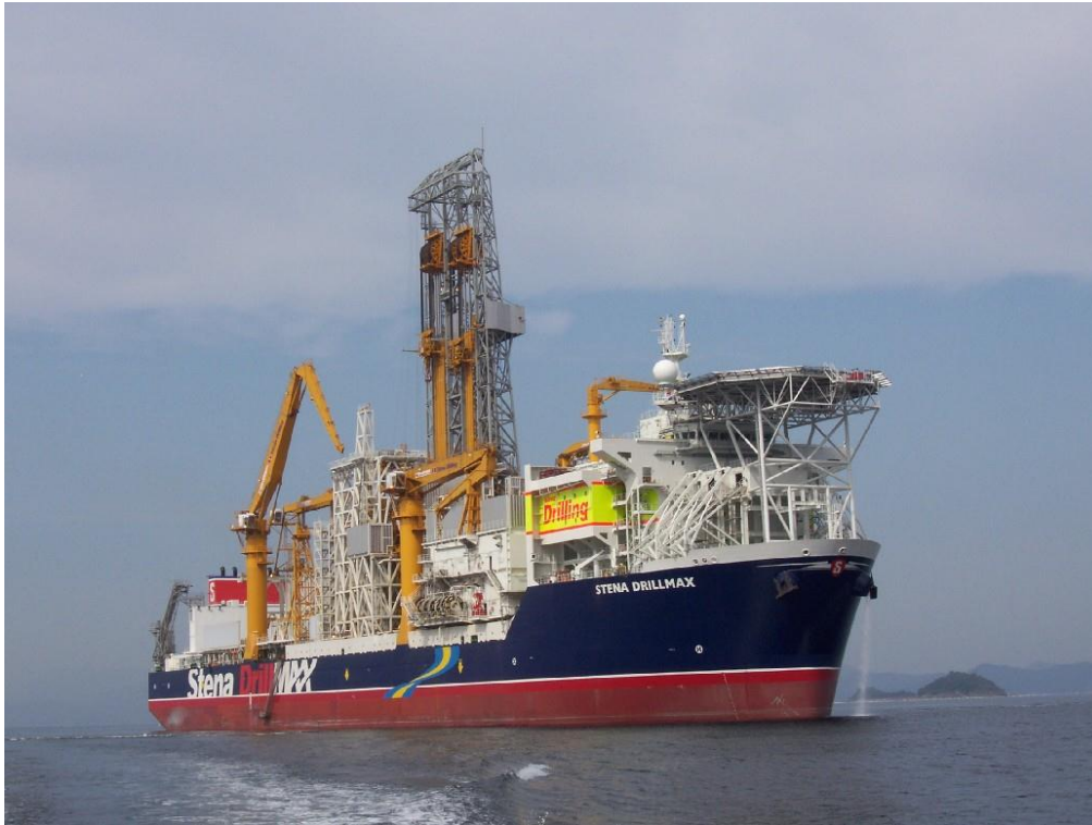
The Stena Drillmax.