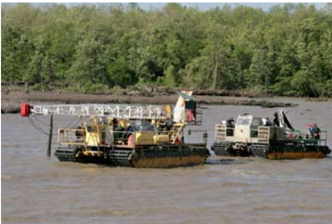
Staatsolie's swamp rig, which will be used for the exploration drilling in the District of Commewijne.

Paramaribo, 21 July 2008 Staatsolie Public Relations